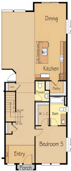
5th Bedroom Option

Square footage is approximate and subject to change. Completion dates are subject to change. Pre-Sale pricing is the base price. Permit Ready pricing includes structural options. Quick Move-In pricing includes structural and personal choice options. Pricing is subject to change. Pacific Lifestyle Homes, Broker. WA LIC# PACIFLH924RI; OR CCB# 173524.