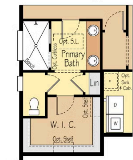
Mud-Set Shower Option