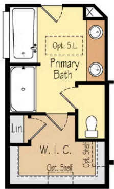
Soaking Tub Option