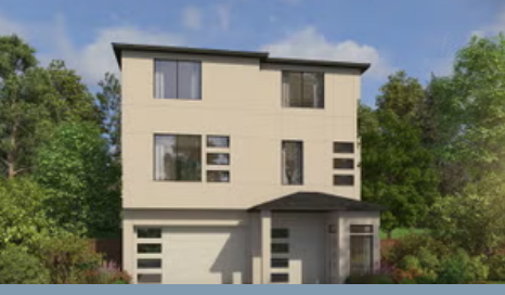
DESIGN STUDIO READY