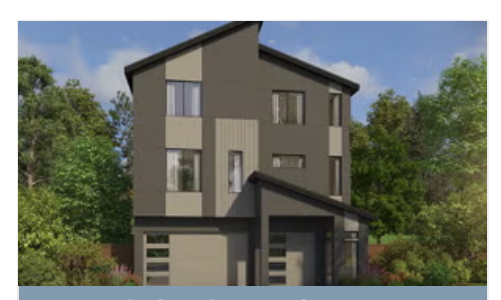
DESIGN STUDIO READY